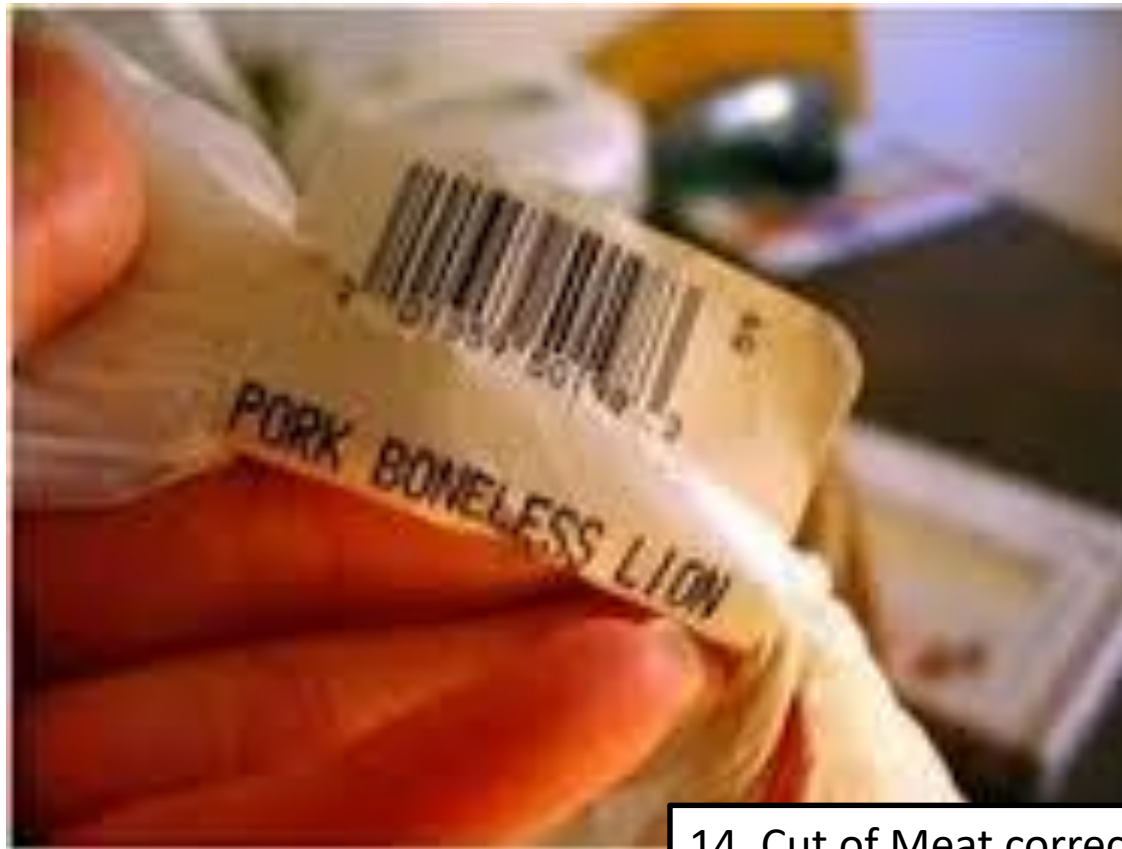
14. Cut of Meat correction