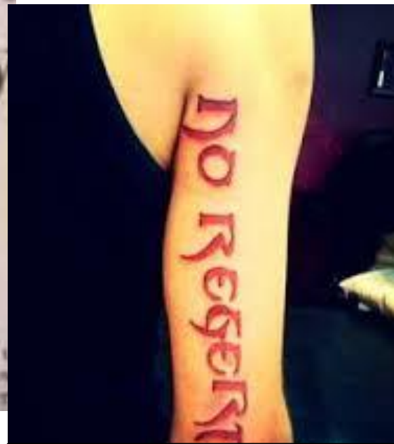
10. Tattoo correction _____