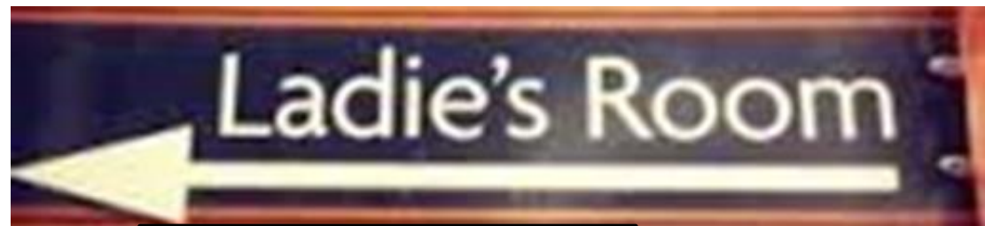
11. Bathroom sign correction _____