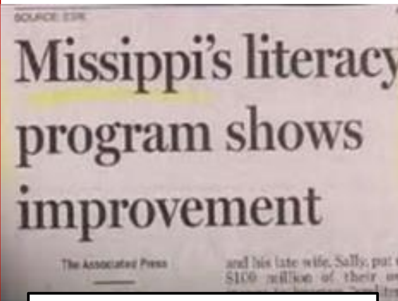
9. Newspaper correction _____