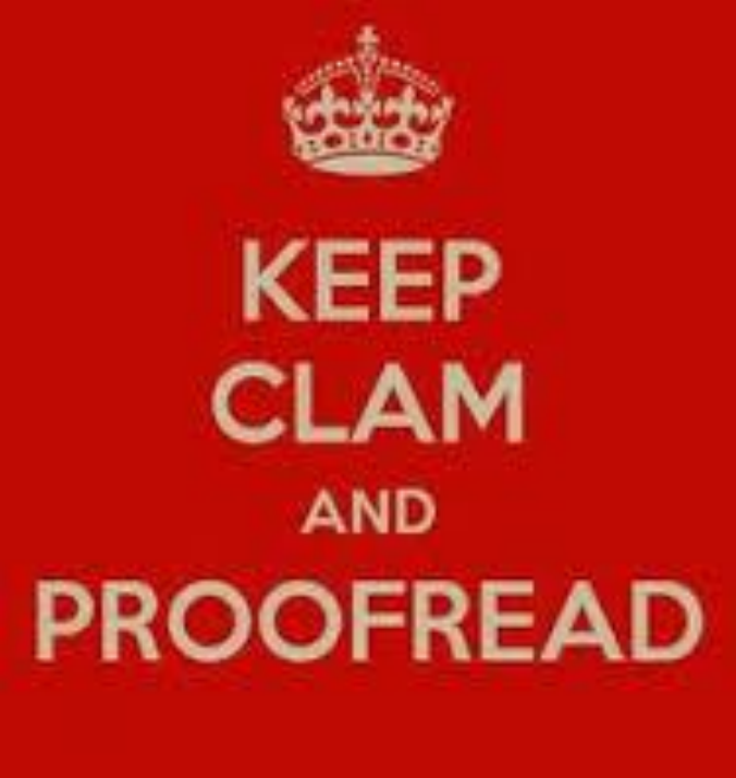
8. Proofreading correction _____