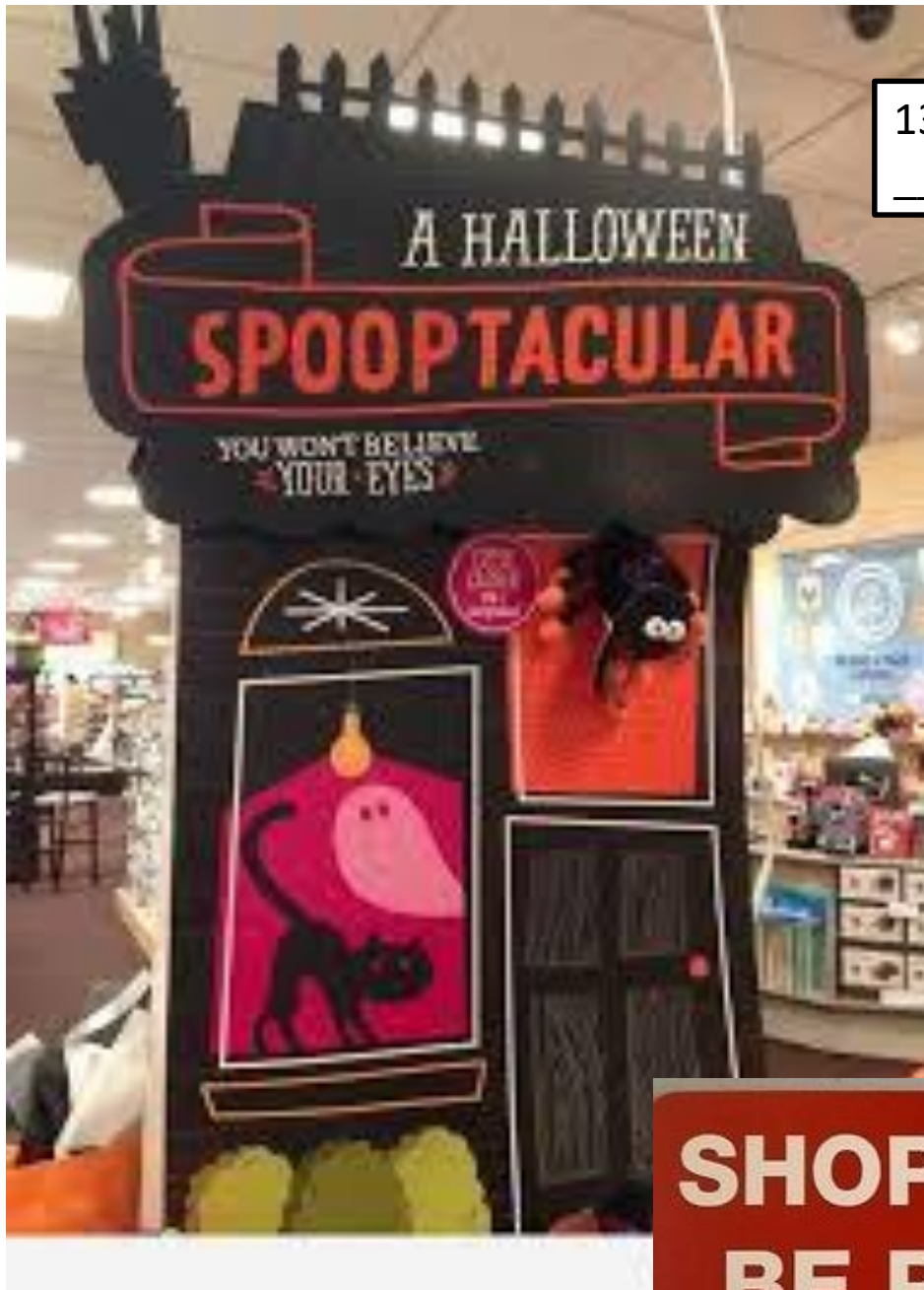
13. That's just Spooky