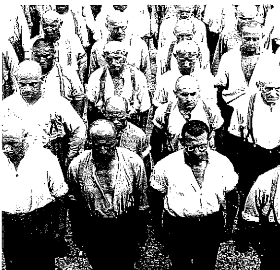
© Yad Vashem, Film and Photo Archive (3101, 4613/38, 4009)